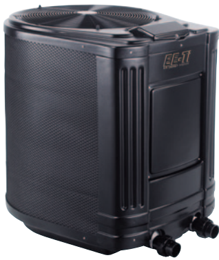
Air Energy Heat Pump