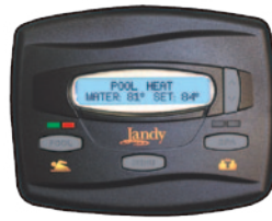
Digital Control Panel